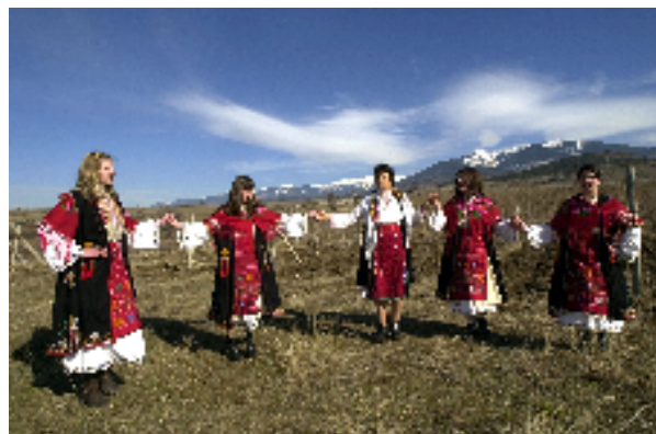
Bulgarian farmers dressed in traditional costumes performing a ritual during a traditional national wine festival for a good wine harvest in the village of Ilindenci, some 120km south of Sofia.

“After considering many markets, many on the outside looking more appealing, Bulgaria offered far too many benefits for us to ignore. Regular visits and in-depth research along with the development of long-term relationships means we have a very stable future that will only grow with EU enlargement” – Sarenmo UK.