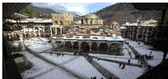
The Rila Monastery in southern Bulgaria.